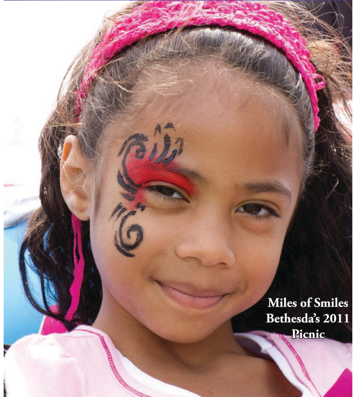
Miles of Smiles Bethesda's 2011 Picnic